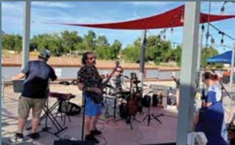
The Kitty Project – Live music