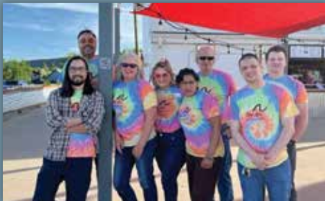
The Staff at The Arc of Larimer County